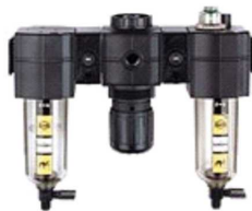
FILTER, REGULATOR & LUBRICATOR